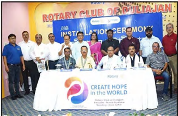
दुलियाजान : रोटरी क्लब के अधिवेशन में मौजूद पदाधिकारी व गणमान्य लोग।